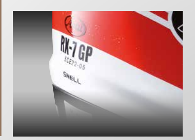
Important Notice: Arai reserves the right to change models, specifications, colours, designs and sizes without prior notice. No rights may be obtained from this brochure. Please note that printed colours are never completely true to actual colours. Helmet colours shown are as accurate as possible, and are subject to limitations of the printing process. No part of this brochure may be produced without written permission from the publisher. Copyright® Arai Helmet (Europe) BV 2018.