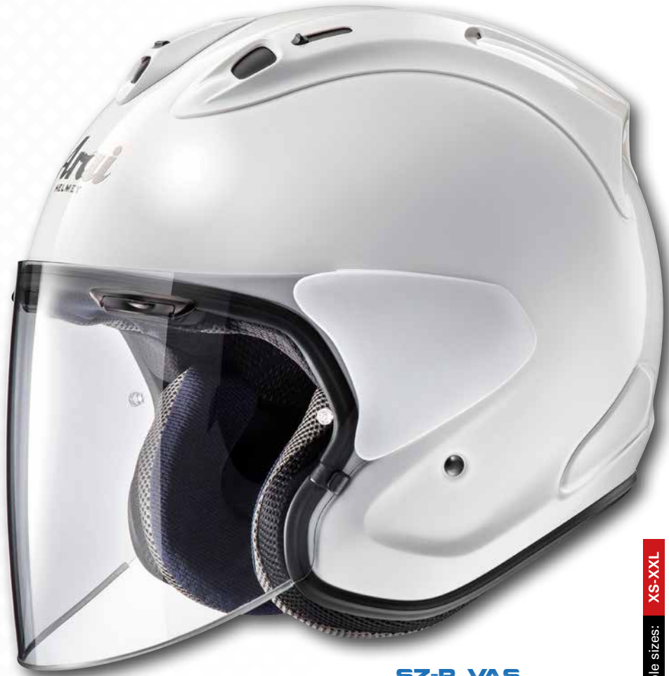
SZ-R VAS Diamond White

** Innovated and exclusively offered by Arai