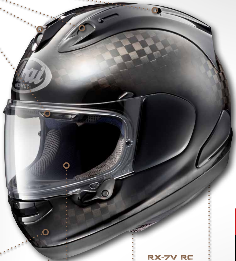
RX-7V RC Carbon

** Innovated and exclusively offered by Arai