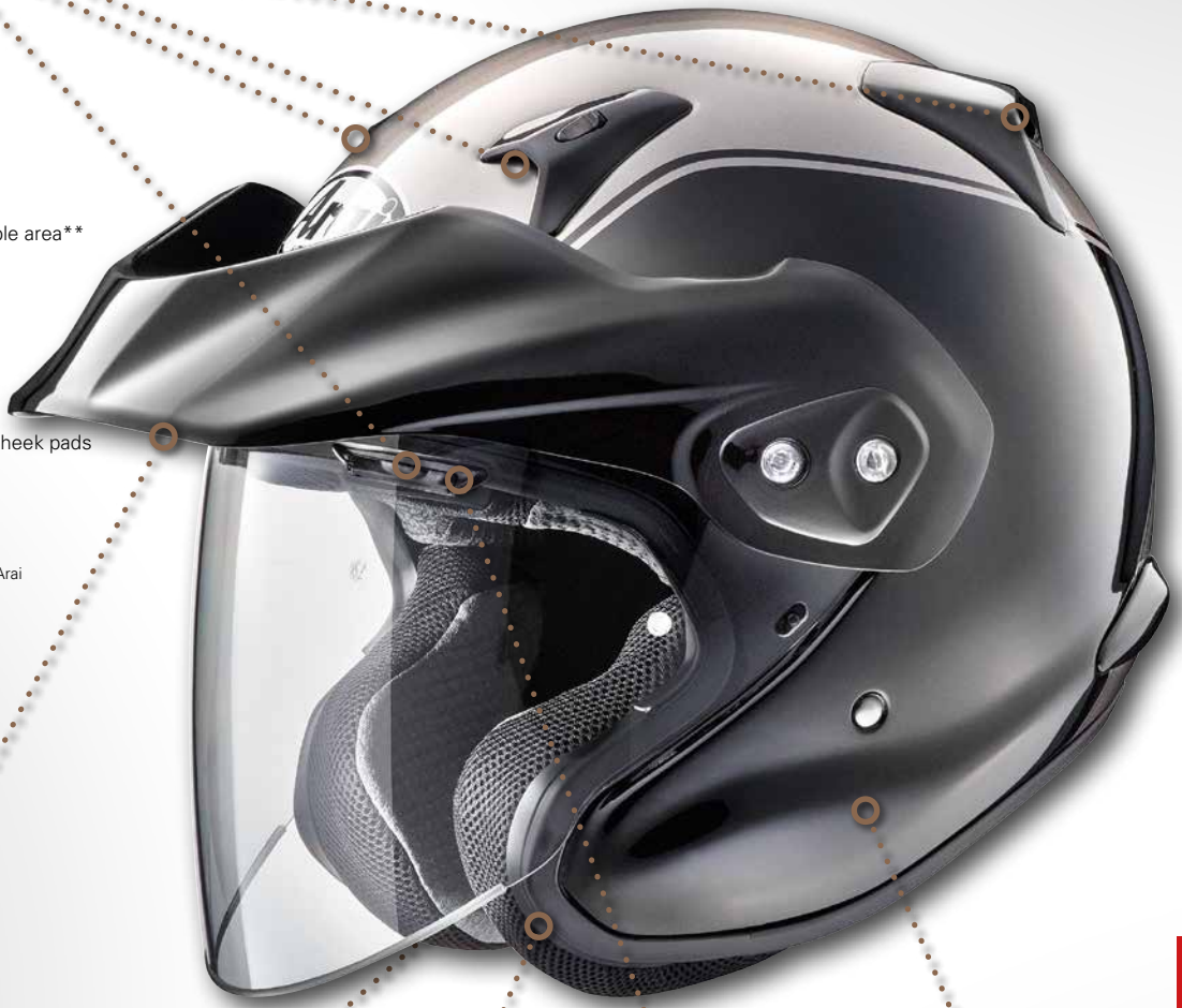
CT-F Gold Wing Grey

** Innovated and exclusively offered by Arai